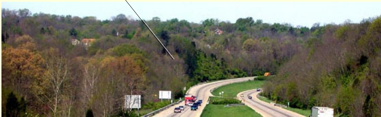
I-74 GREENWAY, looking W from Race Rd. overpass

THE LAND CONSERVANCY OF HAMILTON COUNTY, OHIO