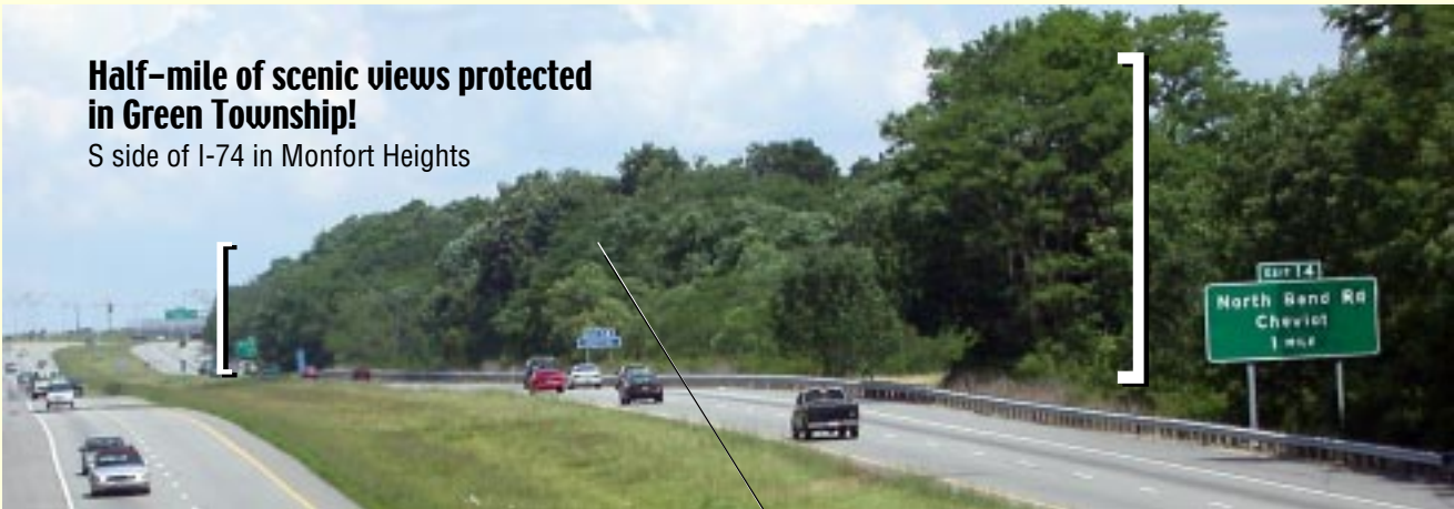
I-74 GREENWAY, looking E from Race Rd. overpass