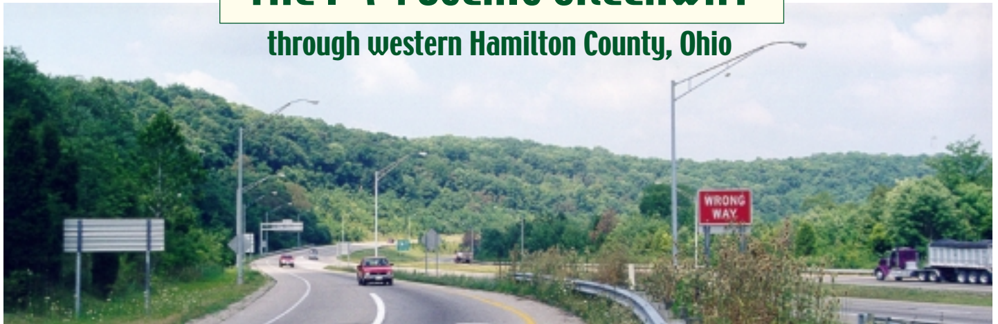
LOOKING WEST: Taylor Ridge crescent at I-74 / Rybolt Road Interchange in Green Township is threatened by development