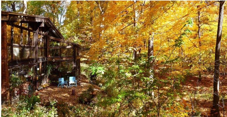
The Lockwoods' distinctive home of wood, glass and stone is tucked under a canopy of trees within the Preserve

In more than 40 years of caring stewardship, the Lockwoods' philosophy has been to leave nature as it is. Native wildflowers flourish on the site — as many as 176 species have