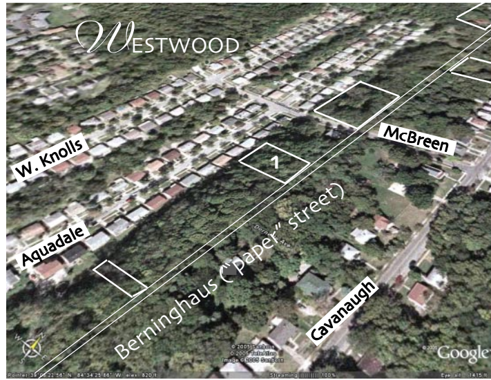
LEFT: Google Earth view of the Westwood site