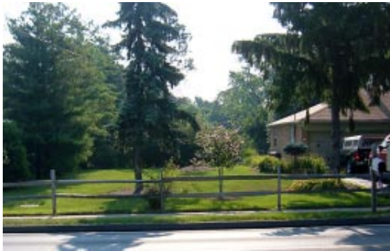
View looking into the property from Cheviot Road

Native plants and wildlife thrive in the sedge meadow wetland on the Enderle-Flick property