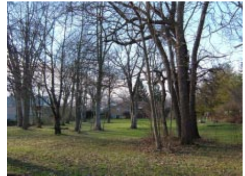
Maples, walnuts, sassafras and redbuds