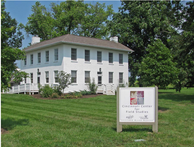
PHOTO UC Center's main building at 11053 Oxford Rd. in Crosby Twp. has been updated to provide lab space, classrooms, conference rooms and offices for UC faculty, researchers and students.

► You're invited! Friday, September 10, 2010 6 - 8 PM